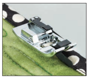
Stitch in the ditch foot

For sewing quilt bindings or concealed seams on clothes.